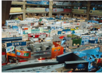
Ideal in large venues.