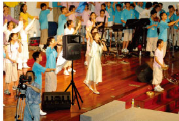
Ideal in large indoor or outdoor events.