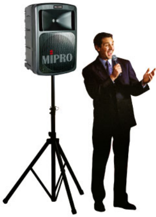
On a Tripod Speaker Stand.