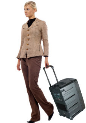
Unique retractable carry handle and lower wheels ensure effortless transportation.